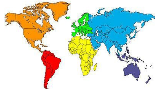
A world-wide community